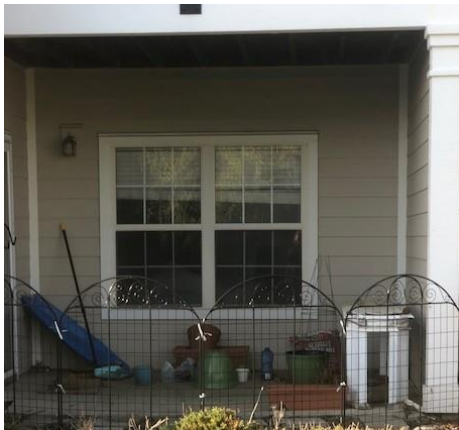
*Patio NOT in compliance with TCC Rules Regulations.

The board is in process of reviewing the Rules & Regulations and will soon amend this document to provide additional clarity of what is and is not allowed outside of units and on patios/decks. In the meantime, we ask that you do your part. There are many residents working hard to help beautify our community. When well maintained, property values are more likely to rise or at least remain stable. Below are some examples patios both in and out of compliance with the TCC Rules and Regulations: