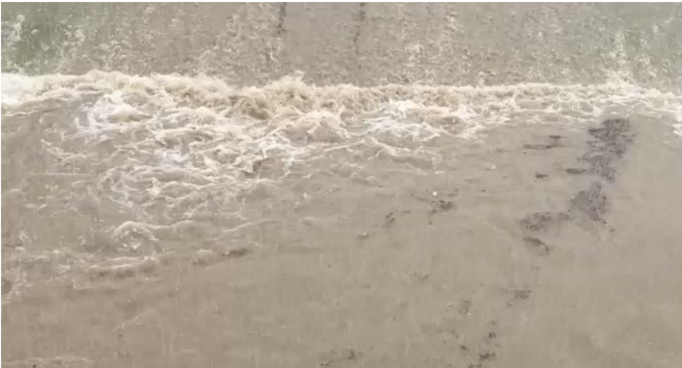
1 Video share.icloud.com