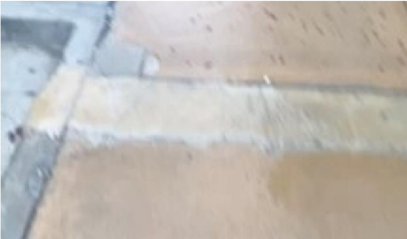
1 Video share.icloud.com